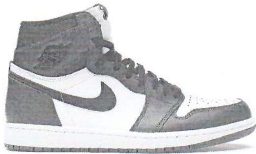
Jordan 1 Retro High Court Purple White